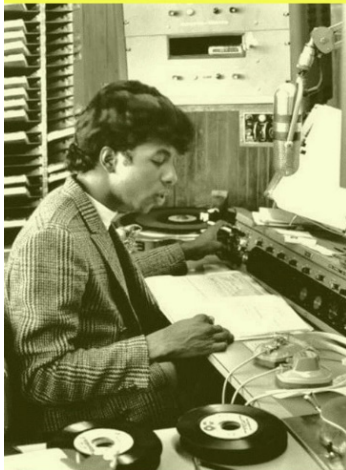
Sunday 20 th March 2022 1800 EST/2200 UTC 9395 kHz via WRMI

On Sunday 20 March at 2200UT, I came across KSOL Radio on 15770 kHz.