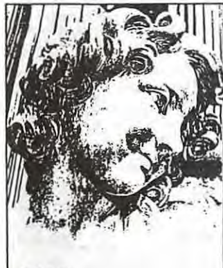
RAI Italia OSL card

受信報告を訂正する場合は、訂正の理由を記入し、 Thank you very much for your reception report