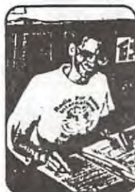
Global Community Radio Dedicated To Peace