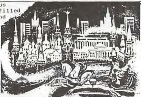
Radio Moscow's Seasons Greetings Card