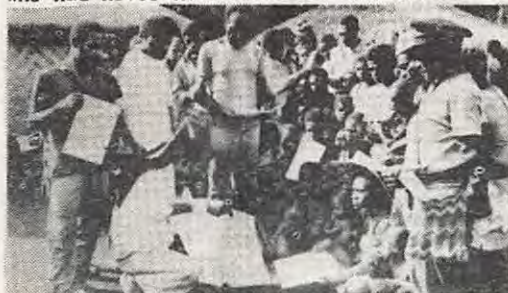
Government officers carry out extensive patrols to keep the people informed of Government policies and developments.

But radio, despite its extensive involvement, has still not reached everyone. In 1975 NBC estimated there were still some 800 thousand persons who had never heard a radio broadcast!