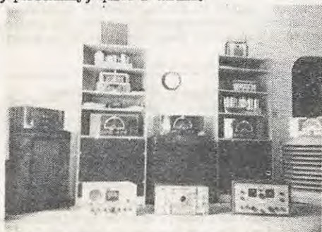
Legend for radios at left: Left to right & bottom to top.

However, with so many excellent present-day receivers available ... why bother with the locating and restoring of a McMurdo Silver, or a Hammarlund, National, Scott or Lincoln? Mainly, I suppose, it is in the excitement of bringing a rare old thing back to life, and finding what it can do. For me, Swaziland, Hanoi, Radio Free Grenada, et al., never sound better than when they first come in on one of my recently restored old classic radios. When those stations start to talk out of an ancient loudspeaker; I'm not merely a listener, but a craftsman witnessing the result of something that my hands and head caused to be reborn. It is, personally, quite a thrill.