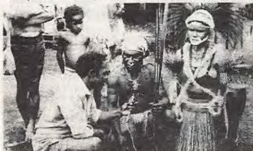
The National Broadcasting Commission makes regular visits to rural villages to involve the people in their programmes.

Said a DXer, a big QSL guy "I've got a verie from Radio Brunei Well, at least I've heard the Far East You see my antenna is placed high"