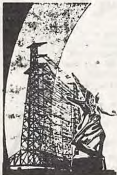
L'antenna Rotante e l'Arcangelo Gabriele

Nous vous en remercions vos lettres nous ont également impressé