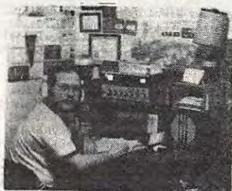
An ideal spot for DXing!