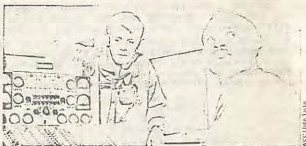
RVOG studio in Addis Ababa

RVOG was teamed together with these studios from the beginning. They produced programmes which were then sent to Addis Ababa to be transmitted back to the originating areas. The area studios not only produced tailor-made programmes according to the specific needs of their regional audience. They were also a decisive factor in the station's efforts to preserve cultural integrity - one of the