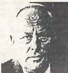
Sir Michael Swann