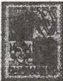
Denmark notes the golden anniversary of radio broadcasting from within its borders with this 90-ore emission due on March 20.

Denmark will commemorate the 50th anniversary of the introduction of radio into that Scandinavian country with a 90-ore stamp on March 20, according to