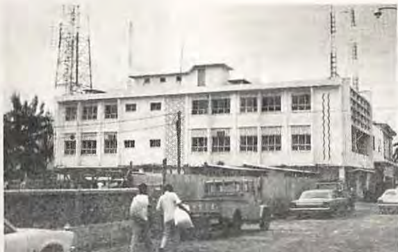
Radio Belize Studios - Albert Catthouse Bldg.

meter band was non the less active, with Zelaya/5950, Casino/5954, TGNA/5955, Occidente/5962, El Salvador/5980, Reloj/6006, Sotavento/6020, TIFC/6037, América/6050, Junco/6077, Hernandez de Cordoba/6100, Mérida/6105, Suyapa/6125 and TGWB/6180 all presenting good accounts of themselves. In addition, the special Radio Canada eclipse test was well-heard on 5970 kHz, the only audible non-Central American at that hour.