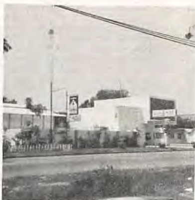
Radio HIN and RAHINTEL, Channel 7, building, 4910 and 1220 kHz. Santo Domingo, Dominican Republic.