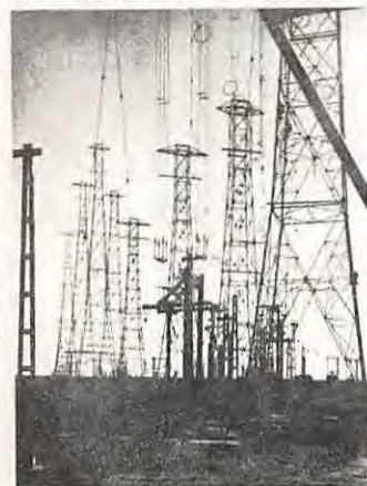
RNE/NOBLEJAS XMR SITE - VIEW -OF CURTAIN AERIAL ARRAYS

Springbok Radio, 11935, scenes of industry card w/full data and sked; 19 days air for one IRC. (Mayer) 16 days; no IRCs. (Reeves) 11935//11835, cards in 2 weeks for 2 IRCs. All details (Perdue) 6 weeks airmail (Guarducci)