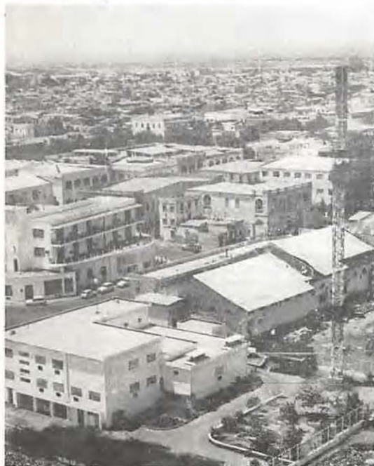
ORTF - DJIBOUTI, AFARS AND ISSAS.

A number of rare QSLs again this month. Of particular interest note those arrowed ( ).