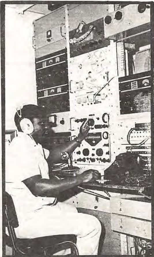
(ABOVE: the RT broadcast control)

Broadcasting also helps adults and students in the service of Tanzania to acquire knowledge and thus overcome our big enemy, IGNORANCE. It provides the listener with facts about both his country and also the world in which he lives. Now we come to the third aim of broadcasting in Tanzania: that is, to provide the listener with facts, and news, and to lead the nation. We all understand that the country cannot raise itself up nor can we build our nation to one of progress and prosperity without the efforts of all our citizens. All together they can raise the standard of living and the expectations of the land. Radio broadcasts make it clear to Tanzanians how to best realize their own progress.