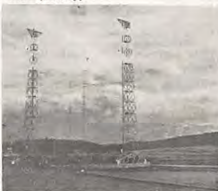
SEB'S NEW HF ROTATABLE AERIAL AT SOTTENS

TUNISIA : RTV Tunisienne, 6195, color p/card of Mosque in 1 month for 3 IRCs. (Conner) 4 weeks for 6195 (Duba, Friedman) 24 days (Webb)