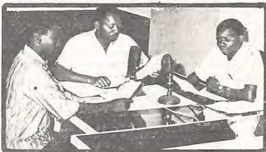
(Going through a geography lesson before recording.)

The important value of the Radio as a means of knowledge comes from the fact that it is capable of bringing often and quickly significant news and facts. Thus, in the effort of teaching, the school radio helps the teacher to use means that he would otherwise be unable to obtain or hear. It also makes accessible the know-how and teaching of the teachers who are highly qualified in certain matters. Experts of this kind are few, and cannot visit every school. In this way the radio shares equally their expertise among all schools who can listen in. Broadcasts are for Primary and Secondary schools, and there is also a program dealing with "Teacher Training College". Helping our teachers is very important, and so we devote special transmissions to this purpose.