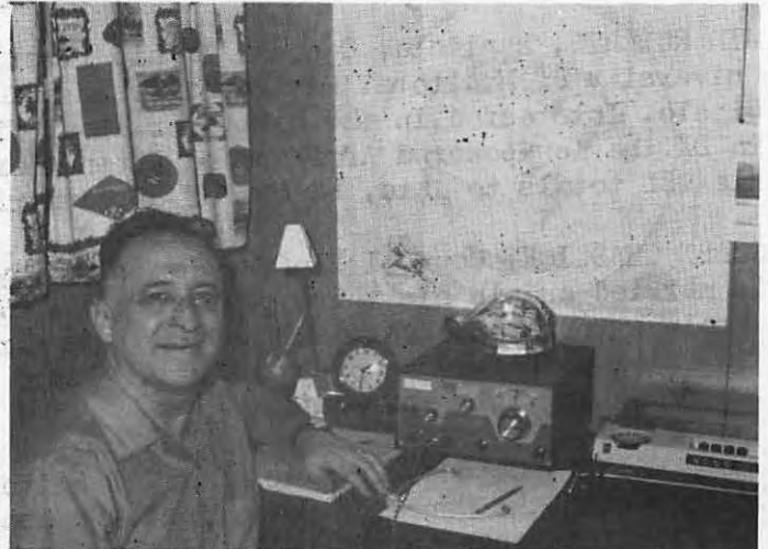
CURNE CHADWICK, IOWA