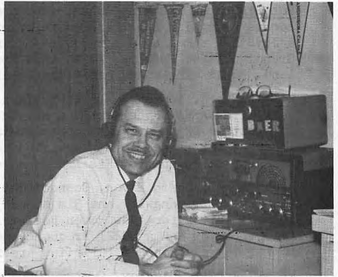
Marlin Field, Michigan