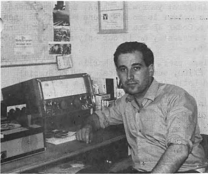
Robert Bruce, Scotland