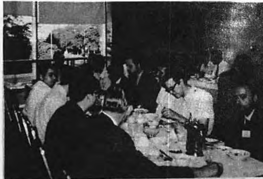
ANARC BANQUET 1970