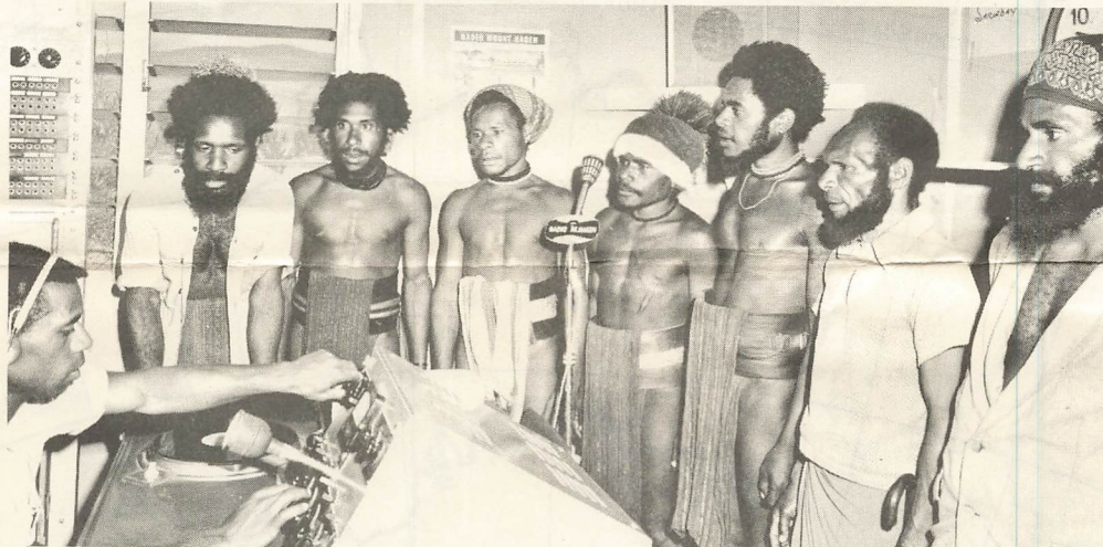
A Radio Mount Hagen announcer interviews a village elder while friends look on.