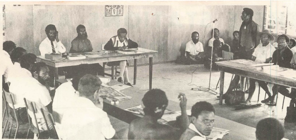
A meeting of the Baiyer Lumasa Local Government Council being recorded for broadcast over Radio Mount Hagen.