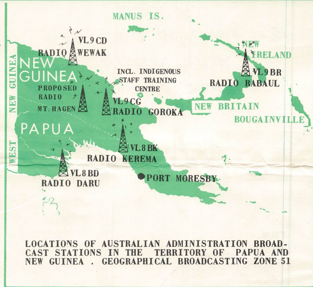
LOCATIONS OF AUSTRALIAN ADMINISTRATION BROADCAST STATIONS IN THE TERRITORY OF PAPUA AND NEW GUINEA . GEOGRAPHICAL BROADCASTING ZONE 51