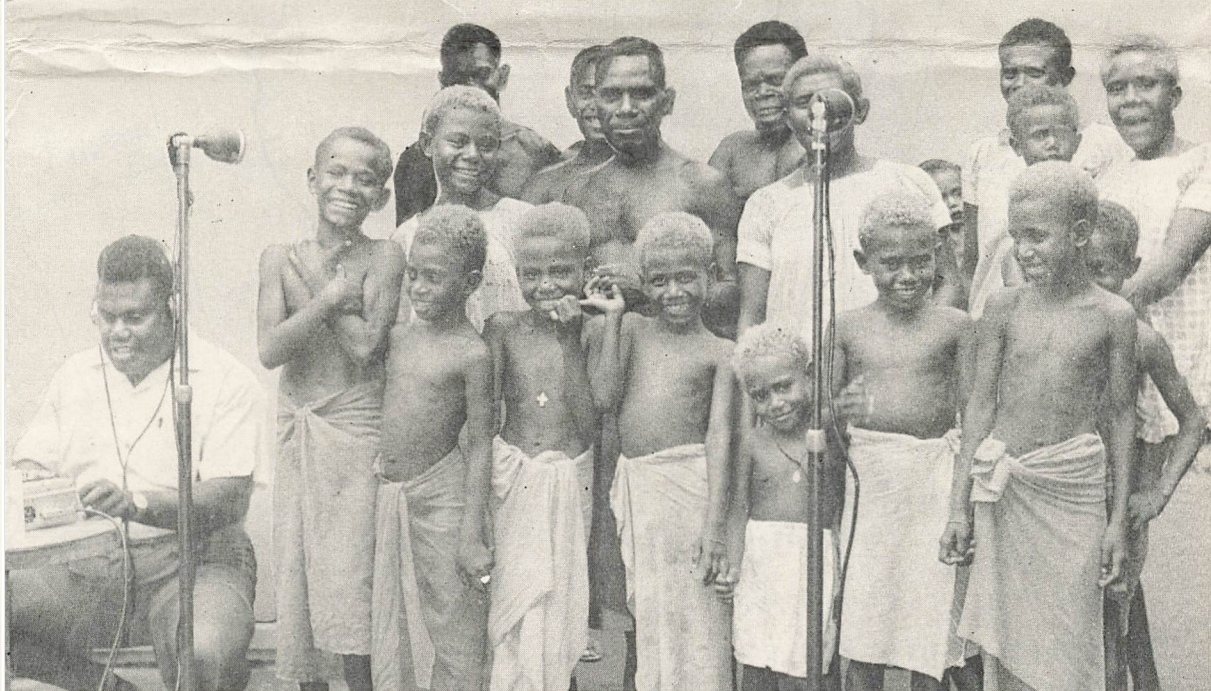
On the spot village choir recordings form a large part of Papuan and New Guinean broadcasting. Often this entails many miles of travelling through bush to a village by station staff.