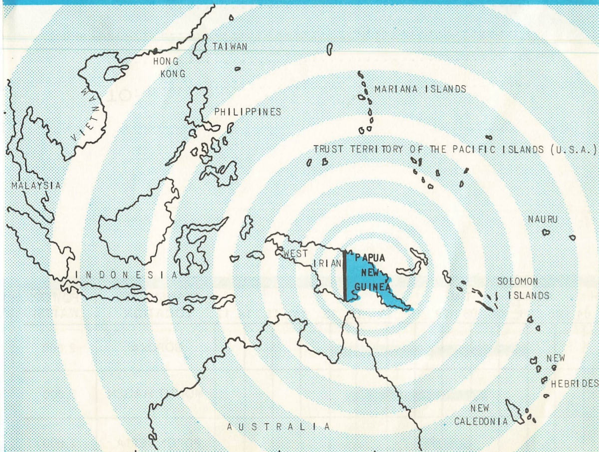
GEOGRAPHICAL BROADCASTING ZONE 51