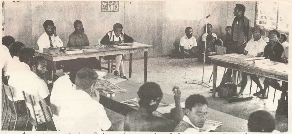
A meeting of the Baiyer Lumasa Local Government Council being recorded for broadcast over Radio Mount Hagen.

THANK YOU FOR YOUR RECEPTION REPORT WHICH IS HEREBY VERIFIED