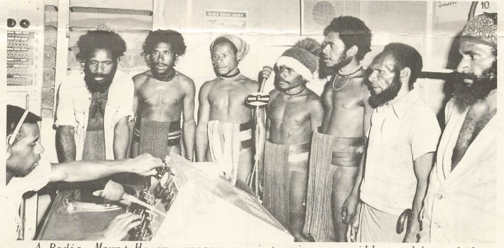
A Radio Mount Hagen announcer interviews a village elder while friends look on.