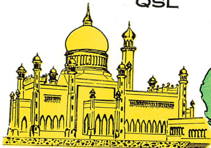
SULTAN OMAR ALI SAIFUDDIN MOSQUE • BRUNEI TOWN